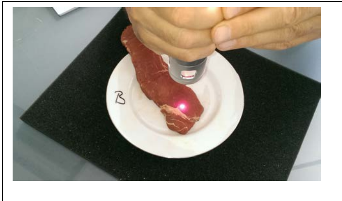
Treatment with a class 4 laser (15 W) in CW mode without moving the applicator Distance to the sirloin steak: 3 cm